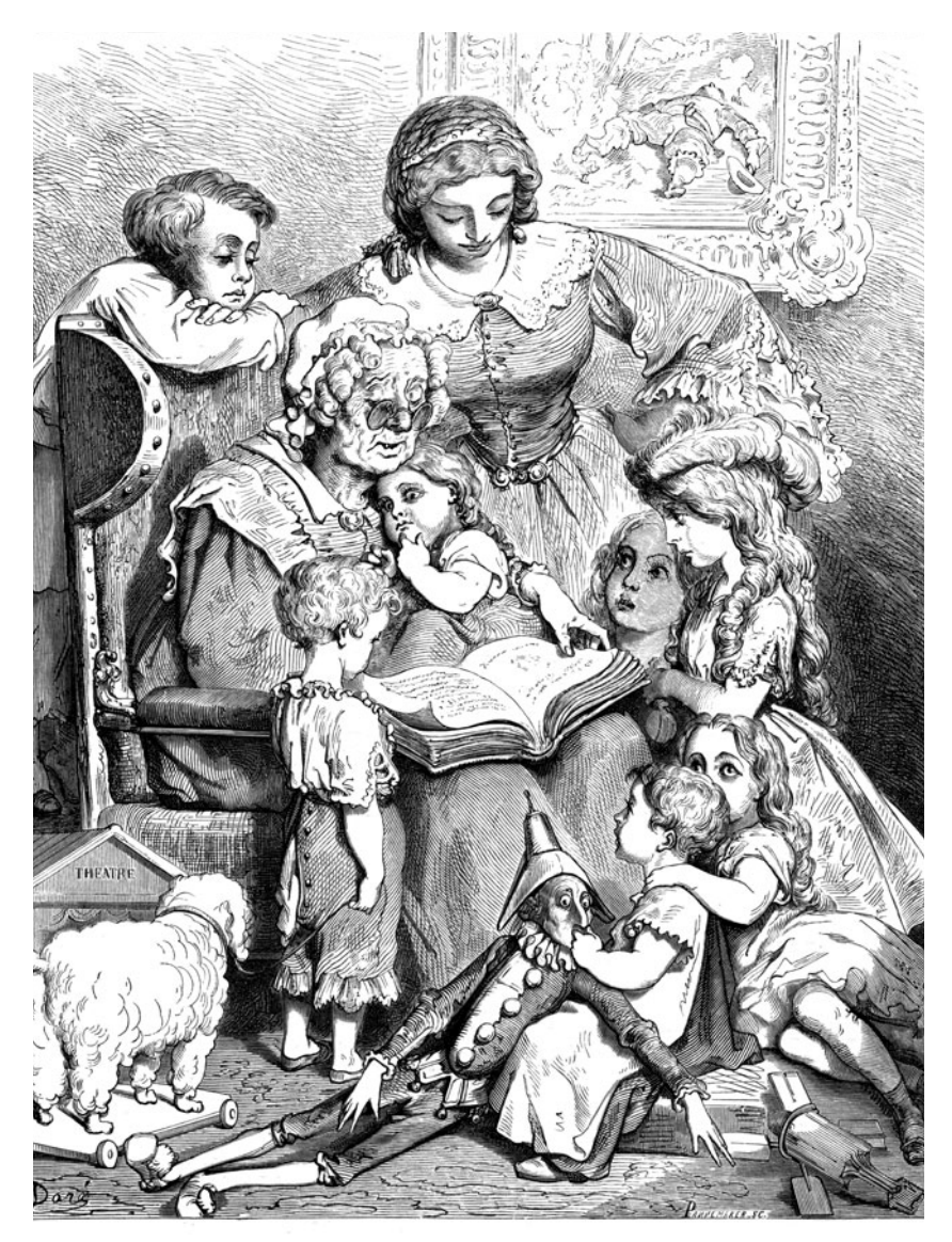
Reading the tales to the family